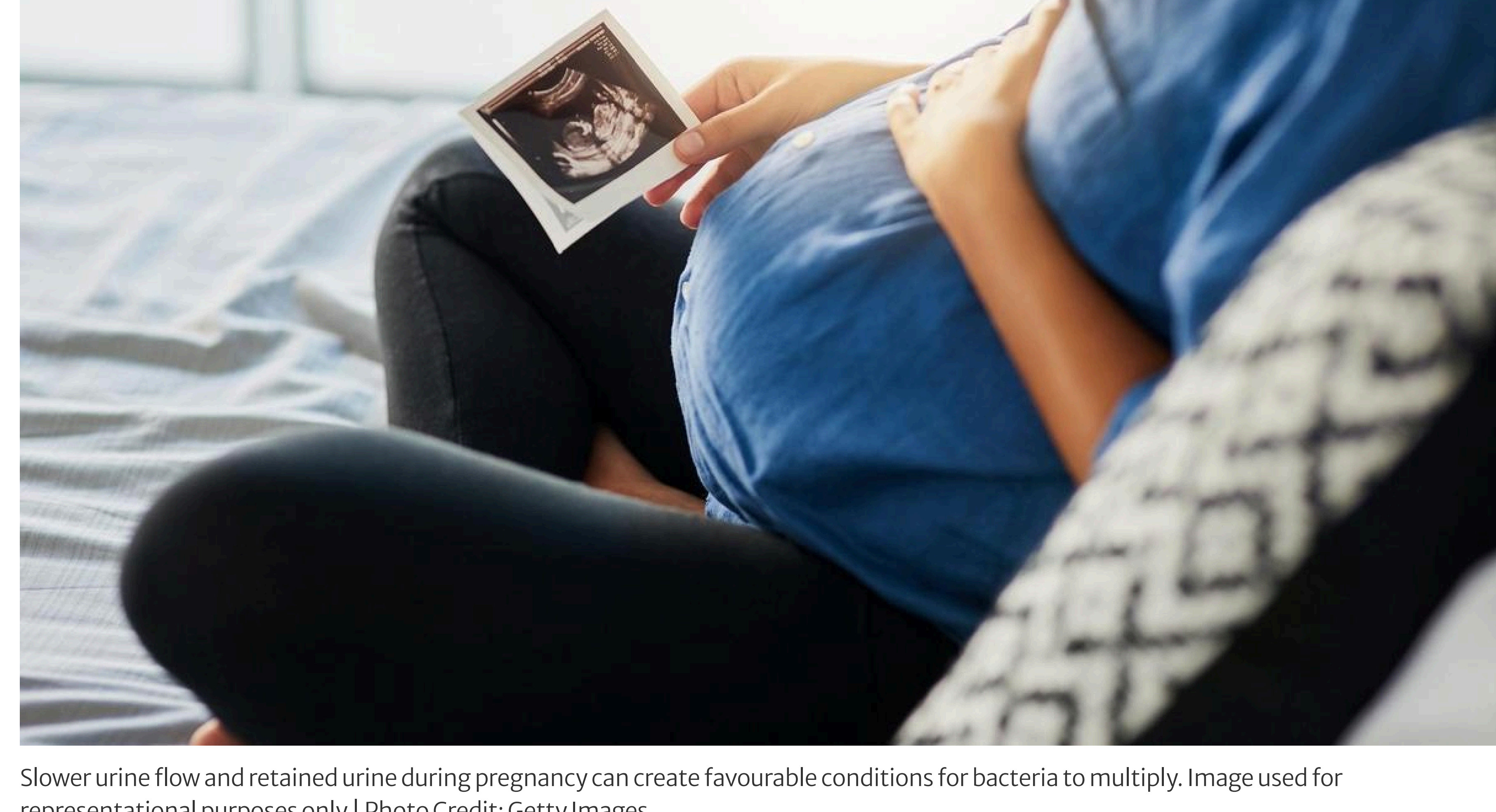
Slower urine flow and retained urine during pregnancy can create favourable conditions for bacteria to multiply. Image used for representational purposes only

Urinary tract infections (UTIs) are among the most common bacterial infections seen during pregnancy, and yet, they are rarely part of conversations about antenatal health. What many expectant mothers may not realise is that pregnancy increases the likelihood of developing a UTI. In some cases, even after an infection has been contracted, there may be no noticeable symptoms. For obstetricians, this is an issue worth discussing and screening for early, because timely treatment prevents avoidable complications.